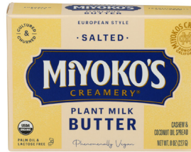
Miyoko's Organic Cultured Vegan Butter