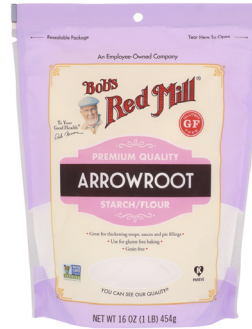
Bob's Red Mill Arrowroot Starch