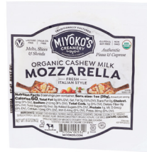
Miyoko's Organic Vegan Mozzarella

Built on the foundation of craft and compassion, Miyoko's Creamery is the natural, compassionate evolution of dairy—using time-honored techniques and the finest ingredients to make our award-winning, phenomenally vegan, plant milk butter and cheese.