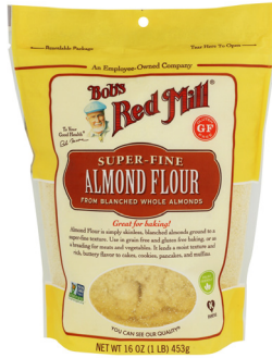
Bob's Red Mill Almond Flour