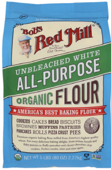
Bob's Red Mill Organic Flour (selected varieties)